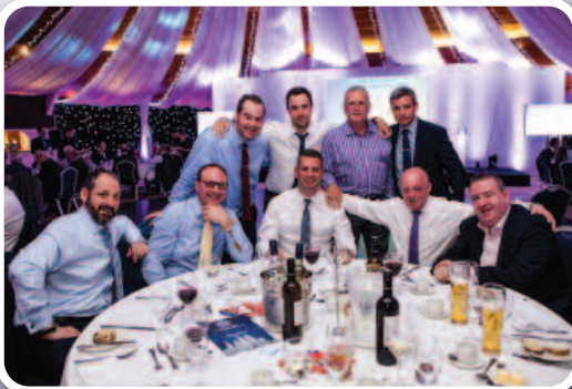
ASHFORD ENVIRONMENTAL SERVICES LTD