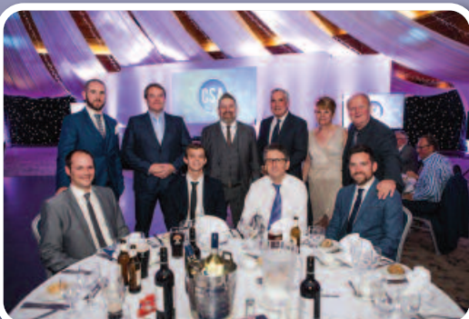
AIRTECH PREMIER LTD