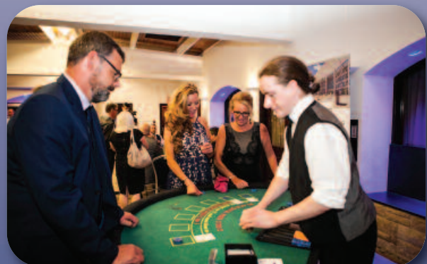
AFTER DINNER ENTERTAINMENT – A FUN CASINO & DANCING