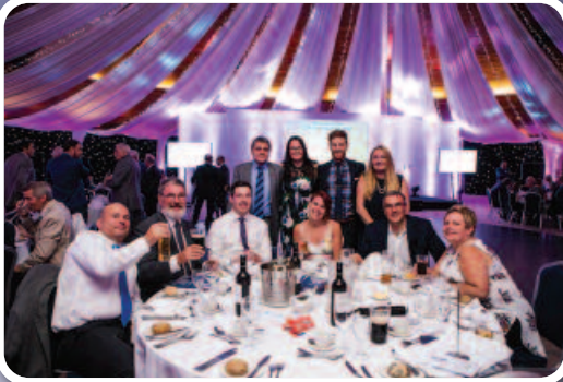
BSRIA INSTRUMENT SOLUTIONS

I would like to personally thank everyone who spent time in nominating students, engineers, products and projects for these awards and to everyone who sat on the judging panel and of course our Sponsors. Hopefully next year some more of our Corporate members will attend and support us – as you miss out on a great evening!!