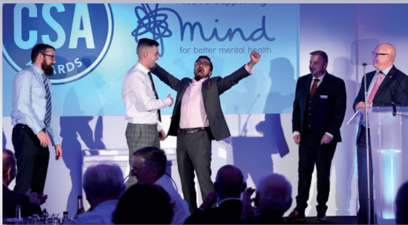
Heads and Tails Game for Mind Charity

The Chairman's choice of Charity this year was MIND and we raised over £1000. Mind is a mental health charity in England and Wales. Founded in 1946 as the National Association for Mental Health, it celebrated its 70th anniversary in 2016. Mind offers information and advice to people with mental health problems and lobbies government and local authorities on their behalf.