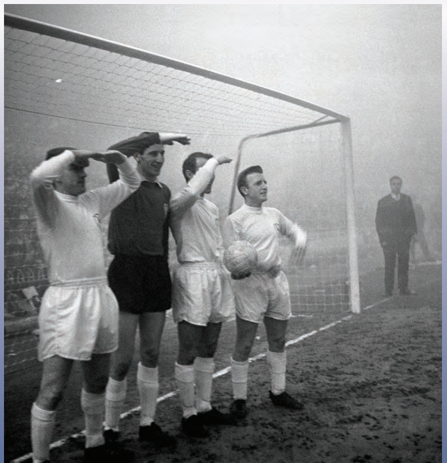
Tottenham Hotspur players peering out into the fog for opposition players after a match was postponed because of poor visibility

Unfortunately, the team have lost sight of the real goal and the finishers in the team appear to have two left feet.