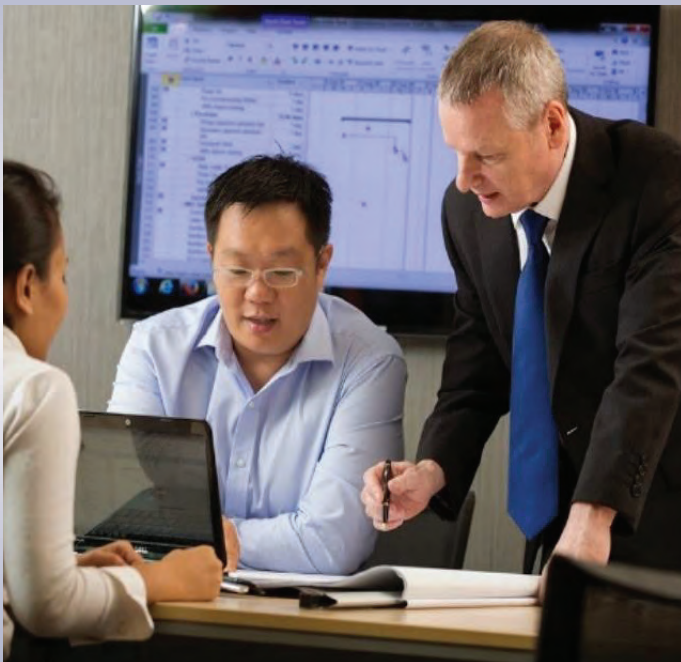
A commissioning team meeting during the design stage of a project

This means that a correctly executed commissioning process requires two completely different, but intimately related, sets of skills. The first specialism is the ability to establish and then manage the overall commissioning process – let's call this Commissioning Management. The second specialism is the ability to physically validate system & building performance – let's call this Hands-on Commissioning. These two interwoven elements of commissioning are both about finishing; firstly by establishing and orchestrating the strategic gameplan and secondly by performing on the pitch during the match.