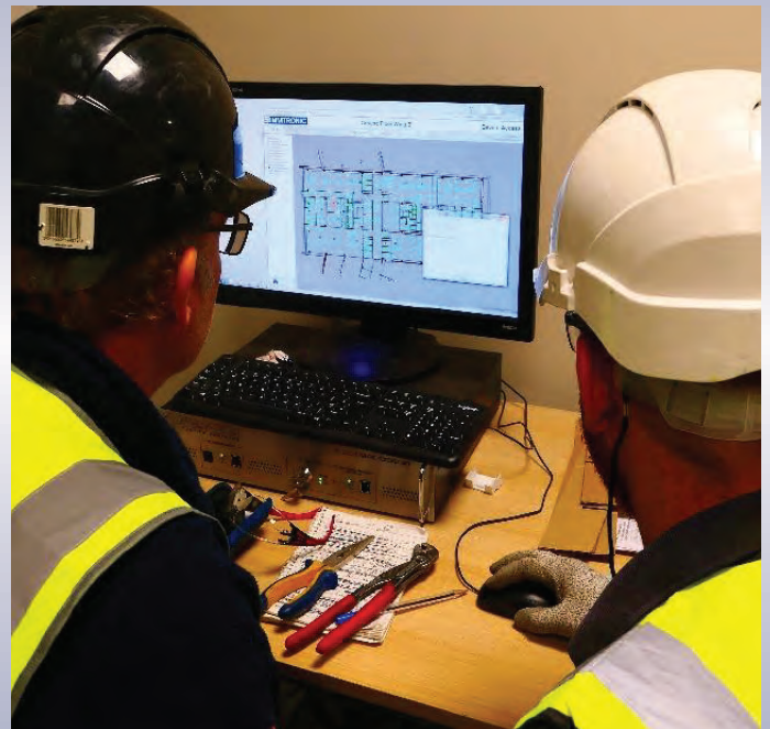
Performance validation of a lighting system on site

The relationship between great finishers and successful teams is a fundamental principle of football, as it is for project delivery. Impressive statistics for passes completed, tackles made or metres run are OK, but without the end product of goals scored and victories attained, they are meaningless.