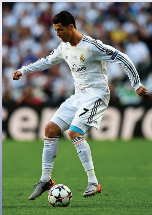
Cristiano Ronaldo playing for Real Madrid

Messi and Ronaldo’s incredible ability to finish translates into the only important statistic in football, the number of matches won. Winning matches delivers success for the teams they play for. Since Messi’s Barcelona debut in October 2004, they have won 9 Spanish League titles, 4 Champions League trophies and 3 Club World Cups. Ronaldo had an equally impressive record at Real Madrid and Manchester United between 2003 and 2018; 4 Champions League trophies, 3 Club World Cups, 2 Spanish League titles, 3 Premier League titles, 1 FA Cup & 2 League Cup trophies.