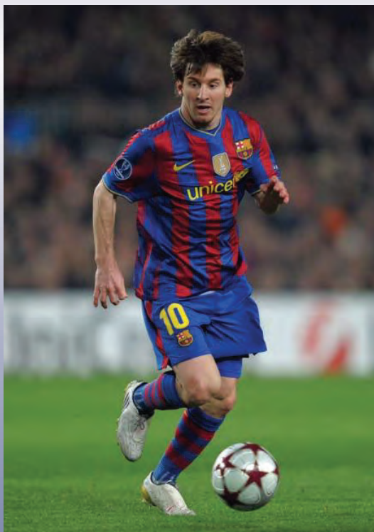
Lionel Messi playing for Barcelona

Players like Messi and Ronaldo convert the work that they and their 10 teammates do into a meaningful resolution - goals. These two men are exceptional at it too: Ronaldo scored 451 goals in 438 appearances at Real Madrid. Messi has scored 585 goals in 668 games at Barcelona.