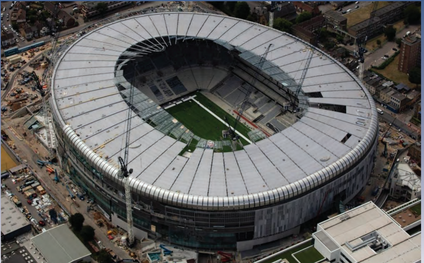
The construction of the new football stadium for Tottenham Hotspur FC

It is currently envisaged that the stadium will not host any matches before the current football season finishes in May 2019. As a consequence of this inability to finish, there has been huge disruption and embarrassment to Tottenham Hotspur Football Club, the reputation of the construction project team has been damaged, and the final project cost continues to escalate.